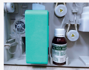
Reagent Pack and TCO 2 Module